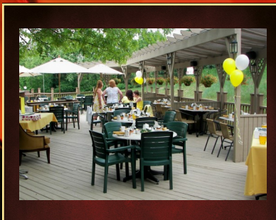
OUTDOOR DECK Seating 20—125 guests