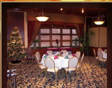
THE CLUB ROOM Seating 20—50 guests